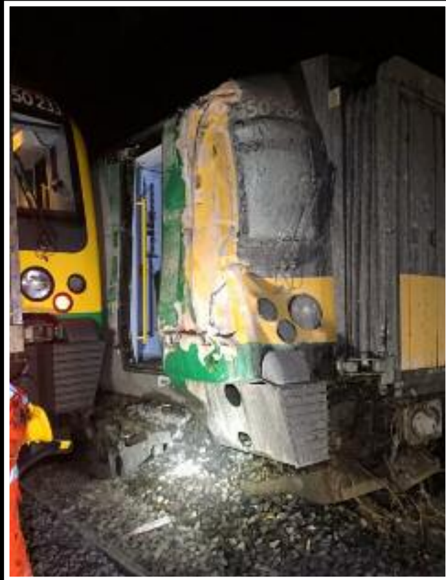
London Midland trains damaged during derailment at Watford Junction following a landslip on 16th September 2016

“ I met up with one of the passengers who was involved in the Watford landslip recently and talked through her experiences on the day in question. Again I heard a consistent and large vote of thanks to our colleagues (Guards) on the day who looked after her and her fellow passengers so well ”